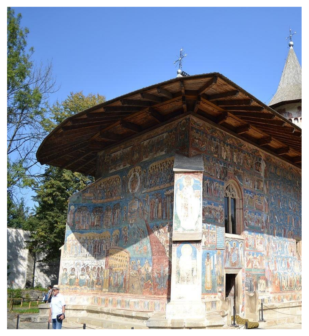
The west facade of the monastery

• On the west facade of the monastery we find the fresco of the Last Judgement – a true synthesis of the Apocalypse. The scales that will weigh people's deeds, the fight between angels and demons for their souls, Heaven, but also Hell with the river of fire are the scenes which conclude the apocalyptic representation from Voronet.